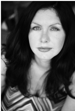
Permission to use author photo and biography granted by HarperCollins.