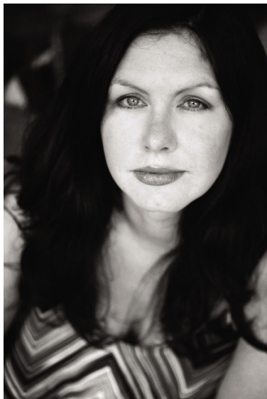
Author photo and biography courtesy HarperCollins; used with permission.

“You see it in all animals—the female of the species is more deadly than the male.”